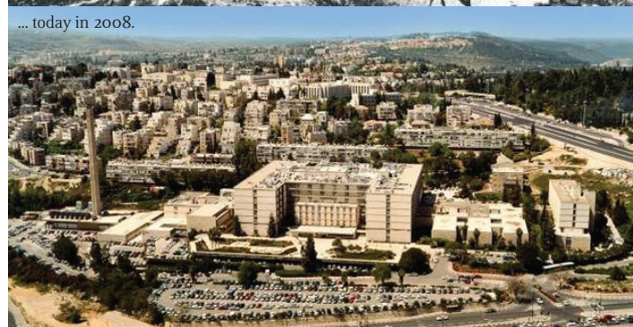
... today in 2008.

“This growth has brought about the need for significant expansion.”